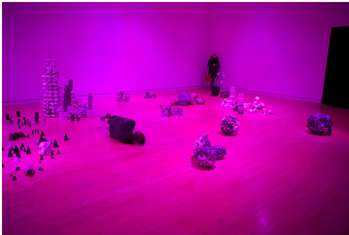
Jaewook Lee, Less in Known on Earth , 2015, various human-made and natural objects, LED grow light, performance, 33 x 33 x 13 ft.