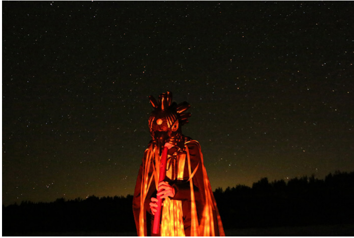
Jaewook Lee, Treatise on Rhythm, Color, and Birdsong , 2020, single-channel video with sound, 21 min.