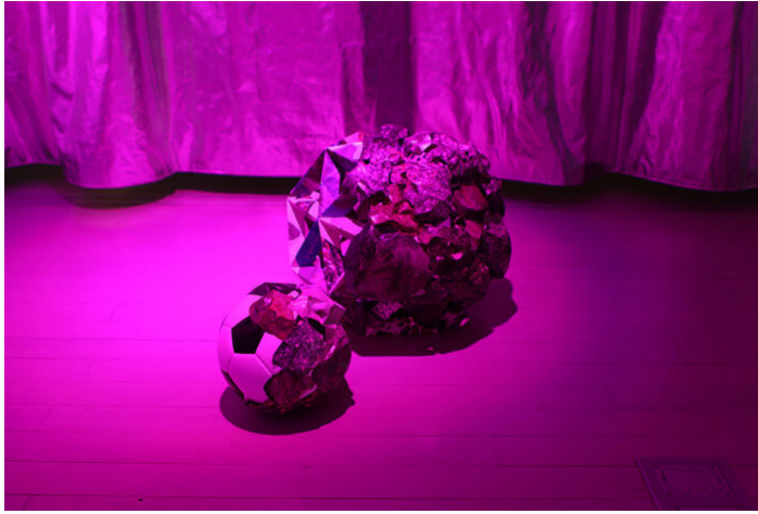
Jaewook Lee, Less in Known on Earth , 2016, soccer ball, LED grow light, 3 x 3 x 4 ft.