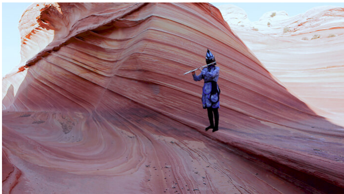
Jaewook Lee, Treatise on Rhythm, Color, and Birdsong , 2020, single-channel video with sound, 21 min.